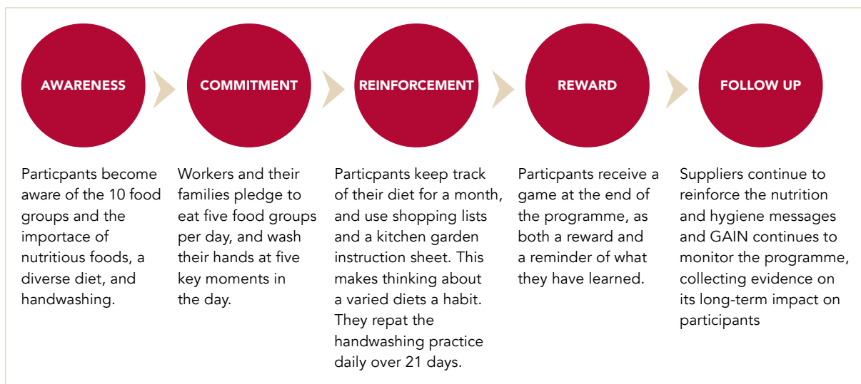
Figure 2: The Seeds of Prosperity Intervention