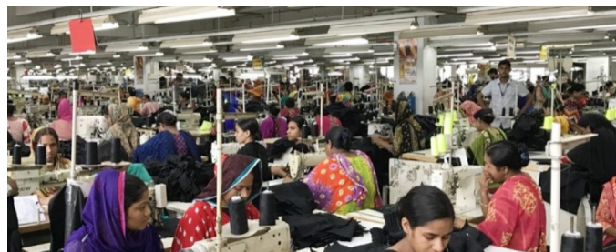
Figure 3: Ready-made garment factory workers in Bangladesh

Together with implementing partners and the Government, and working with 82,000 workers in 24 ready-made garment factories each employing 4,000-6,000 workers (mostly women of reproductive age), GAIN designed a Workforce Nutrition (WFN) model called "SWAPNO", a Bangla word (meaning "Dream"), which stands for "Strengthening Workers' Access to Pertinent Nutrition Opportunities".