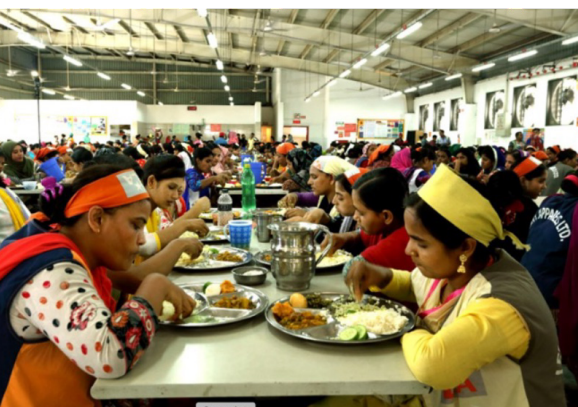
Figure 4: Ready-made garment workers at lunch in a factory