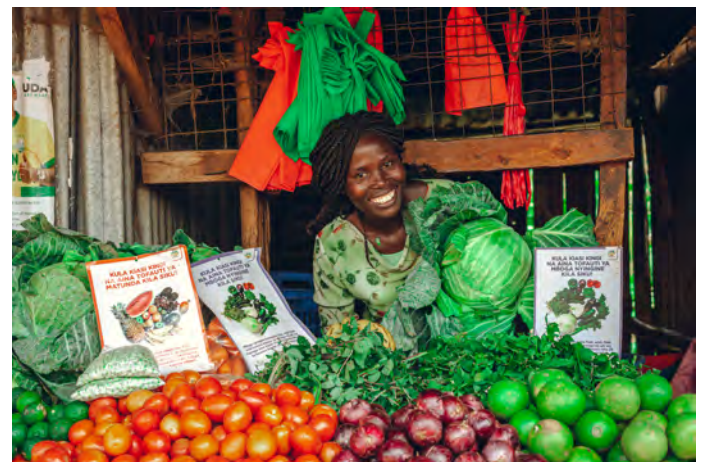
A trained Kiosk vendor' displaying educative food tags in market

The training was intended to enable the traders and for vegetable kiosk vendors around the tea factories to realise the potential role they could play in influencing the healthy food choices of the customers, and how this socially responsible role can still converge