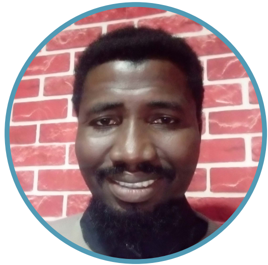
FOUNDER, FARMSPACE TECHNOLOGY

INNOVATION: ECHOTRONICS SOLAR- POWERED REFRIGERATOR BOX