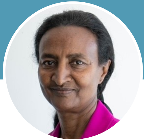
CEO, THEDAY AGRO INDUSTRY PLC