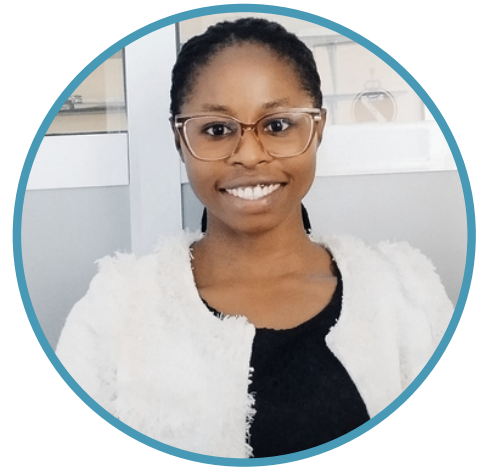
BUSINESS LEAD, SCRATOP NIGERIA LIMITED