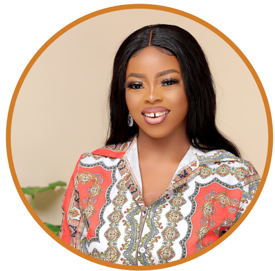
FOUNDER, MEATDIRECT TECH