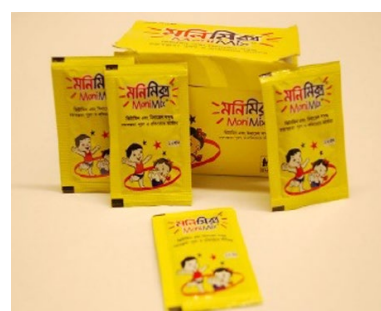
Figure 2: Micronutrient powders sold by SMC's community health workers