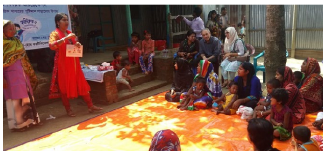
Figure 3: BRAC community health workers engaging with mothers about the micronutrient powders

The Maternal, Infant and Young Child Nutrition (MIYCN) Home Fortification Programme was implemented in 164 Upazilas (sub-districts) & 6 urban slums in Bangladesh (area coverage 33.3%) during July 2013–April 2018. The programme provided age-appropriate counselling on Infant and Young Child Feeding (IYCF) and home fortification to improve micronutrient intakes of 6–59 months of aged children in the rural and urban slum communities of the selected areas. BRAC's community health workers visited the households of the targeted children to provide this intervention and sell micronutrients. 5 The total number of children aged 6–59 months reached was 5,358,604 for the full programme period by BRAC and SMC.