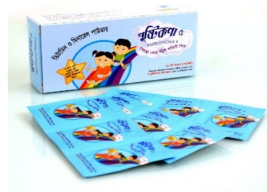
Figure 1: Micronutrient powders sold by BRAC's community health workers

The provision of free MNPs through the health system is not necessarily sustainable. The question was, can MNPs be sold at an affordable price such that they have a significant impact on under 2 anaemia? If this is possible, what is the cost-effectiveness of doing so? GAIN, BRAC, SMC, Renata, a Bangladeshi pharmaceuticals company, icddr, and the Children's Investment Fund Foundation (CIFF), set out to evaluate whether such a programme could reach those who are vulnerable, whether they were impactful and whether they were good value for money compared to other routes to improved nutrition outcomes.